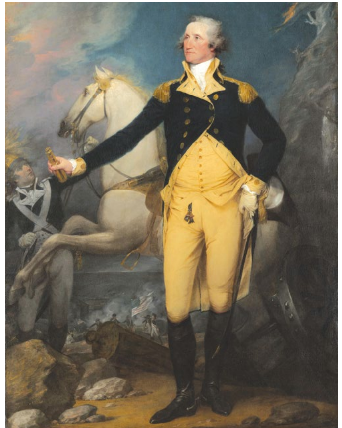
General George Washington at Trenton by artist John Trumbull (1756-1843), Yale University Art Gallery. This 1792 painting was among a collection of 100 works that Trumbull donated to Yale in 1831 in exchange for a $1,000 annuity.

The same conditions faced by John Trumbull are what drive interest in charitable gift annuities today: the desire for stable income that can't be outlived, and to do something useful and philanthropic with accumulated assets.